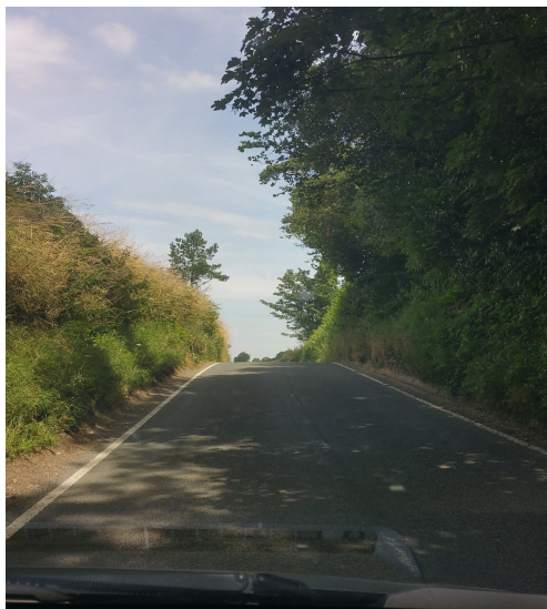
Pinch Point 002