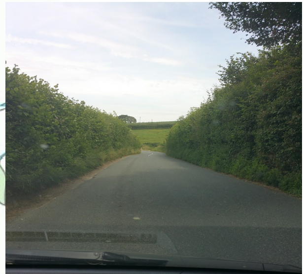
Pinch Point 001